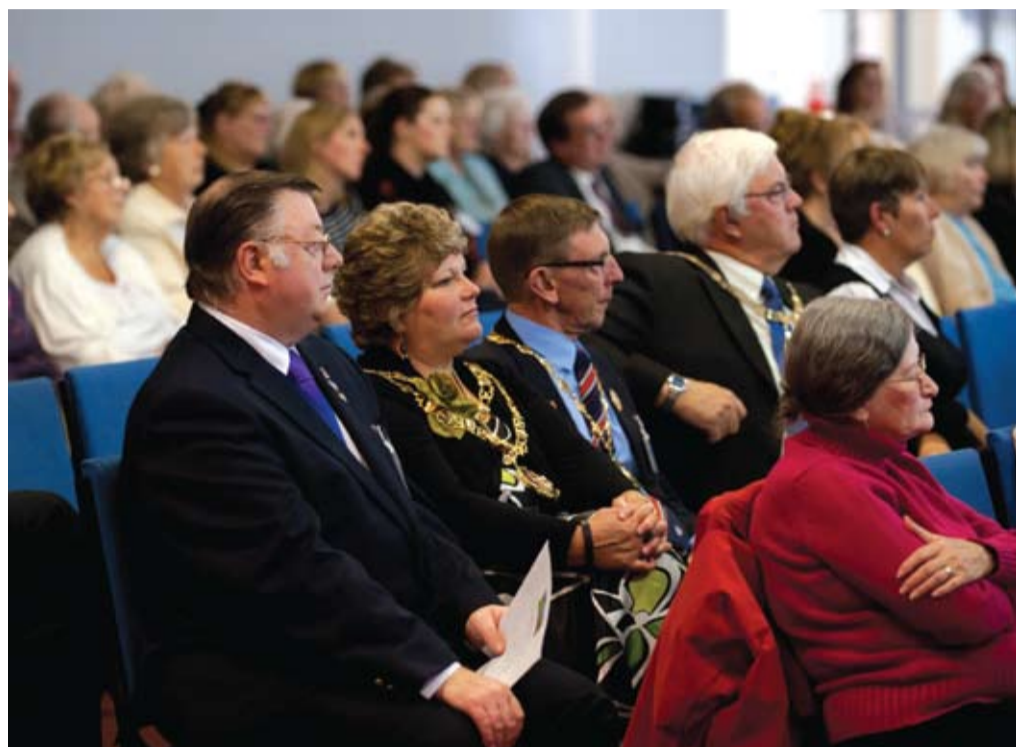
Invited guests and residents taking their seats

On 21 September we held our annual meeting where over 240 people including 150 residents and numerous invited guests from across the county gathered for the morning at the Kings Centre in Eastbourne.